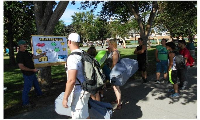
Summer at the Coeur d'Alene City Park