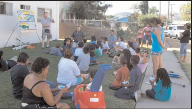
Neighborhood Childrens' Meetings

Cancellations must be received no later than May 31st. OAC reserves the right to close or cancel the seminar because of maximum (limit 15) or insufficient enrollment or any unforeseen circumstances.